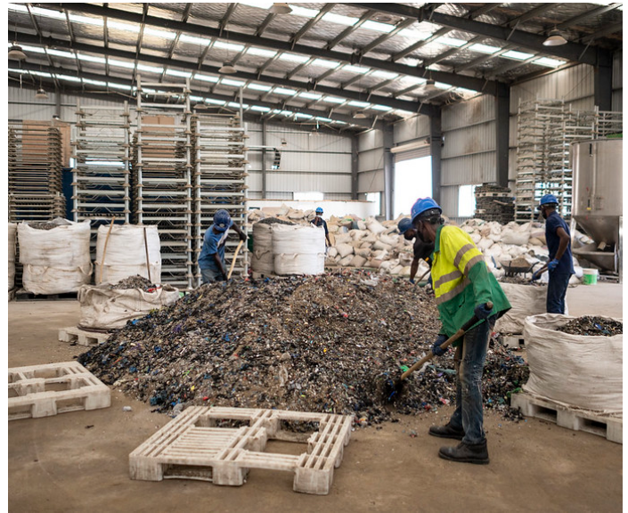
Employees managing debris at a plastic factory.

The researchers developed the framework as a conceptual model for evaluating a community’s overall level of exposure risk from plastic. When making environmental justice investments, California has historically defined communities using census tracts: small areas of approximately equal population. By assessing relative exposure across the three categories, decision-makers can prioritize and target investments toward the highest-impacted areas, tailoring them to a given area’s needs. The highest priority should be given to areas that face high levels of all three exposures, or a triple-burdened community , while double-burdened and single-burdened communities should be a lower priority for investment.