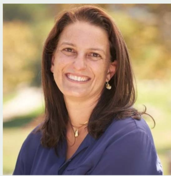
LA Councilmember Katy Yaroslavsky