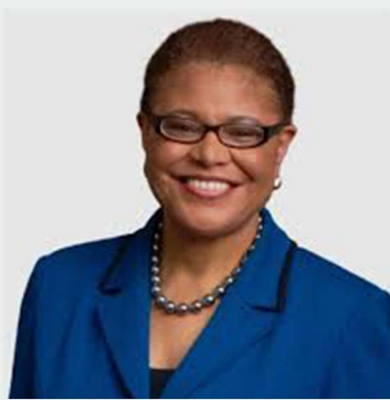
Mayor Karen Bass City of Los Angeles