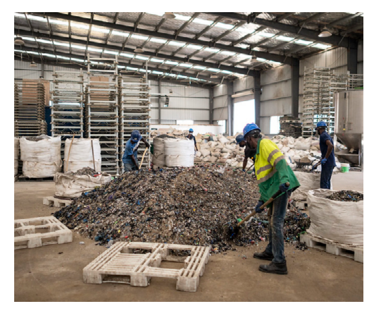
Employees managing debris at a plastic factory.

The researchers developed the framework as a conceptual model for evaluating a community's overall level of exposure risk from plastic. When making environmental justice investments, California has historically defined communities using census tracts: small areas of approximately equal population. By assessing relative exposure across the three categories, decision-makers can prioritize and target investments toward the highest-impacted areas, tailoring them to a given area's needs. The highest priority should be given to areas that face high levels of all three exposures, or a triple-burdened community , while double-burdened and single-burdened communities should be a lower priority for investment.